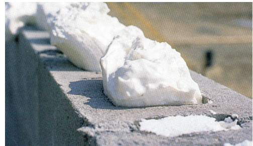
Tailored Foam Block Wall Insulation