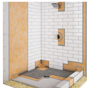
Kurdi Shower System