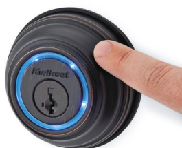
Optional Keyless Locking System

38. We include a choice of four different styles of lever locks for ease of use and better appearance. Each of these styles is available in two different finishes. We also offer options for new keyless lock systems such as those shown at left.